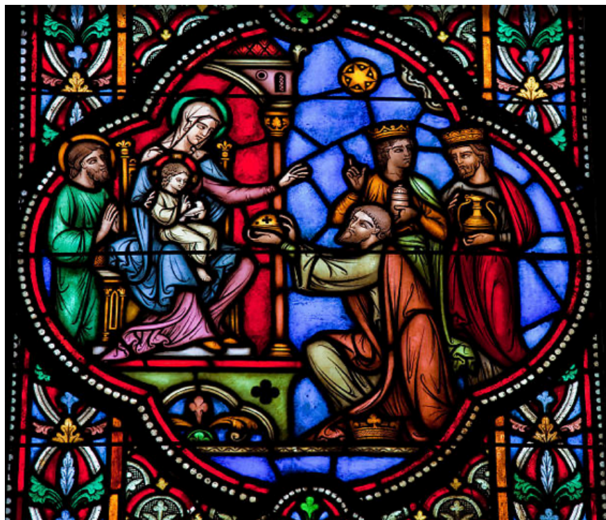
Three Kings from the East, Brussels Cathedral, 1866