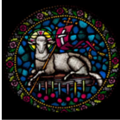
Stained glass depicting the Lamb of God, Matthias Church in Budapest, Hungary